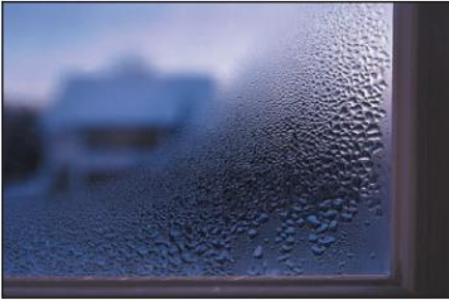
Condensation on the inside of a window-pane.