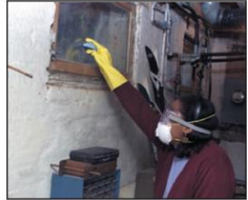
Cleaning while wearing N-95 respirator, gloves, and goggles.